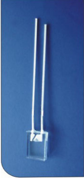
Name: Square without flange LED lamp SIZE: 2.0*4.0*5.0mm MODEL: 245